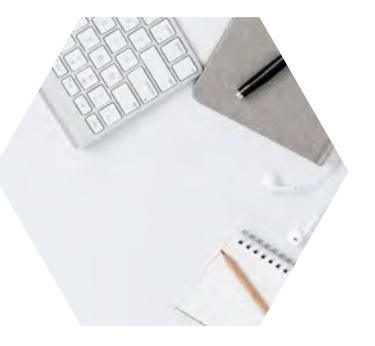
Working with Cooperatives